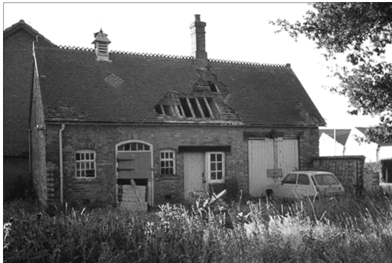
Coach House, Wykin Lane 1995